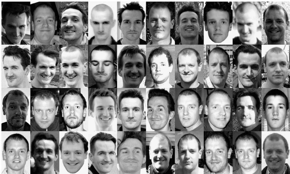
Figure 2: An example of the task used by Jenkins et al.

A powerful insight into the nature of this problem derives from a sorting task devised by Jenkins, White, Montfort, and Burton (2011). Participants were given a set of 40 photographs of faces like those shown in Figure 2 and asked to sort these into piles of photographs of the same person.