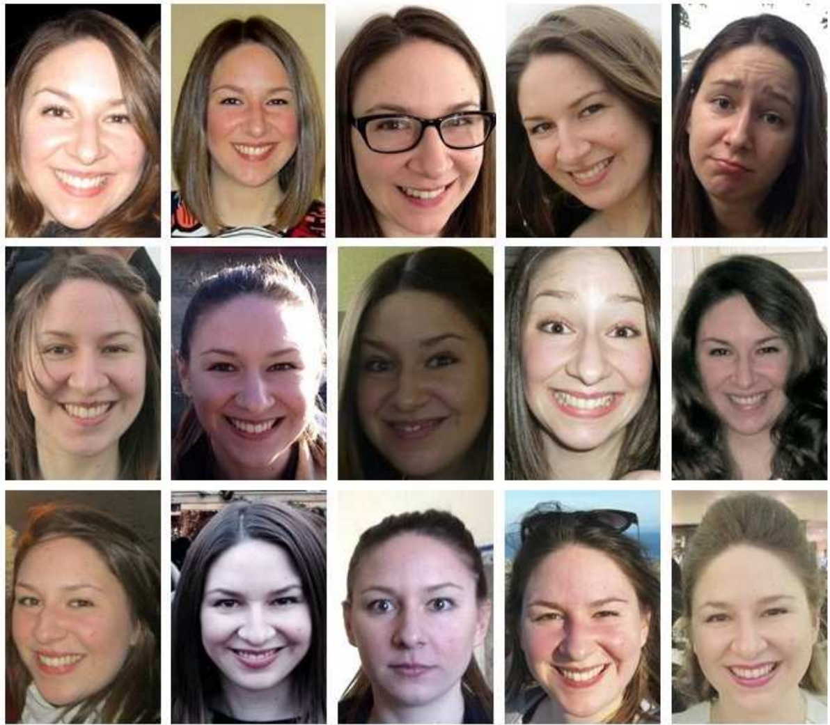
Figure 1. Example stimuli for Experiment 1. Multiple images showing the same identity, but varying in lighting, colouring, hairstyle, etc. [Copyright restrictions prevent publication of the actual images used, though these are available from the authors. Images in Figure 1 are illustrative of the experimental stimuli, and depict someone who did not appear in the experiments but has given permission for the images to be reproduced here.]

Following the ratings task, participants completed a speeded name verification task. A name was displayed on the screen for 1500 ms, and then replaced by an image which remained on the screen until response. On half of the trials, the face matched the name. Participants responded via button press, indicating whether the image showed the same person as the name or not, and were instructed to respond as quickly and as accurately as possible. There were 15 match trials per identity, each showing the person named, and the images previously rated for likeness. The 15 mismatch trials per name showed 5 images of three of the other identities, counterbalanced across identities to ensure each name and each person were seen