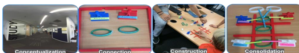
Figure 2: Visual overview of modelling mapped to 4C framework

In the second loop, twenty-four, ( n=24 ) first-year student participants currently enrolled in an information technology program were recruited as volunteers from an Australian University who enrolled in a SAD unit. Ethics clearance was granted for this study before running the experiment. All participants received a short lecture PowerPoint slide highlighting the 4C framework that provided a visual overview of the process to model their system as shown in Figure 2. A demonstration of the experiment with the tools and a usability assessment survey was also outlined.