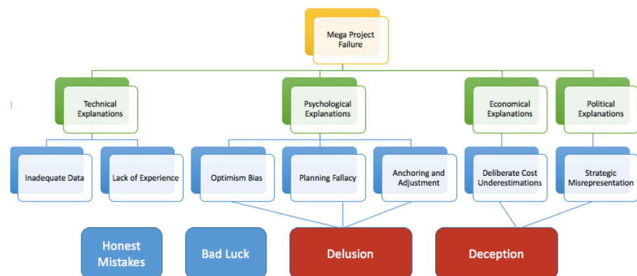
Exhibit 2 Explanations of Megaproject Failure and the Underlying Reasons

While the subject of poor decision making could be applied to all types of project, the focus of this research is large scale transport infrastructure megaprojects. The comprehensive analysis carried out to date by Flyvbjerg, Nils and Rothengatter (2003), Flyvbjerg, Skamris Holm and Buhl (2003), and Flyvbjerg (2007; 2009; 2014) provides clear context and purpose to the research by identifying ultimate factors specific to megaprojects. Flyvbjerg, Skamris Holm and Buhl (2003) distinguished four categories of explanation of cost overruns on megaprojects; technical, economical, psychological and political. Technical explanations include; inadequate data and lack of experience, or honest mistakes and bad luck. Economical explanations portray cost underestimation as deliberate and economically rationale. Psychological explanations include; optimism bias, the planning fallacy, and anchoring and adjustment. A political explanation is strategic misrepresentation. All four ‘explanations’ can be attributed either individually or collectively to decision-makers and their respective behaviour during various phases of project development and implementation. Lovallo and Kahneman (2003) suggested that the underlying reasons for all forecasting errors can be grouped in to three categories (Figure 2): 1. delusion, 2. deception, or 3. bad luck or honest mistakes.