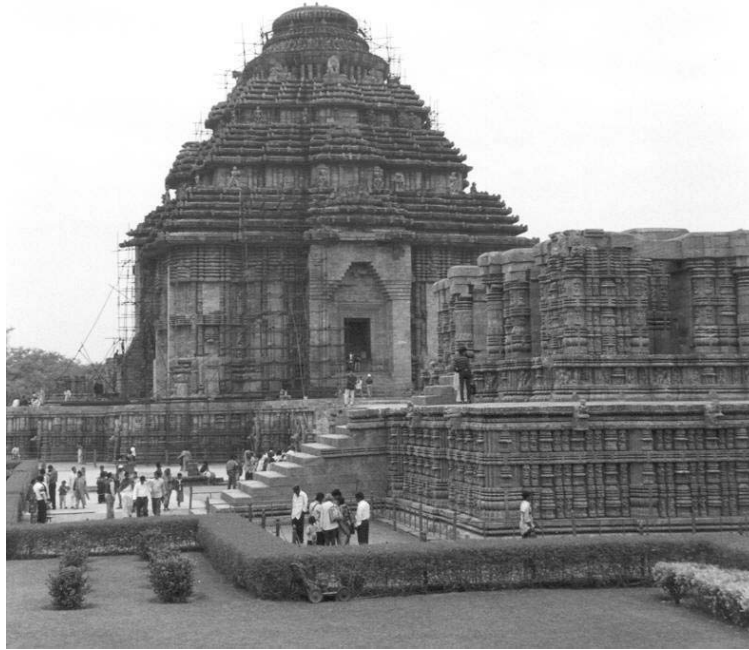
Konark , one of the many fine temples in Orissa