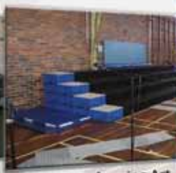
Media & Performing Art