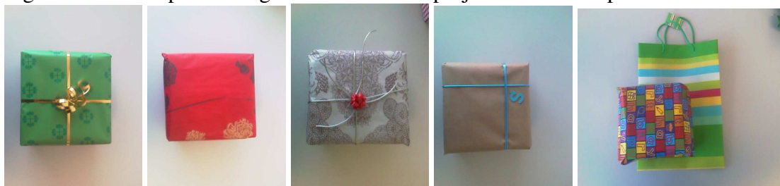
Fig 1.1-1.5 A sample of the gifts created in the projective workshops.

This was particularly important for gifts that were given to acquaintances where less was known about the receiver. The givers felt they should play it safe so as not to offend the receiver in any way: