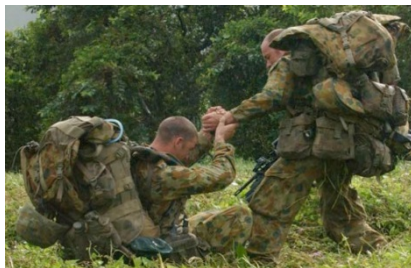
1 Joint Public Affairs Unit - Achieves