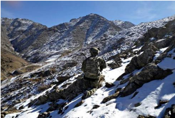
1 Joint Public Affairs Unit - Achieves