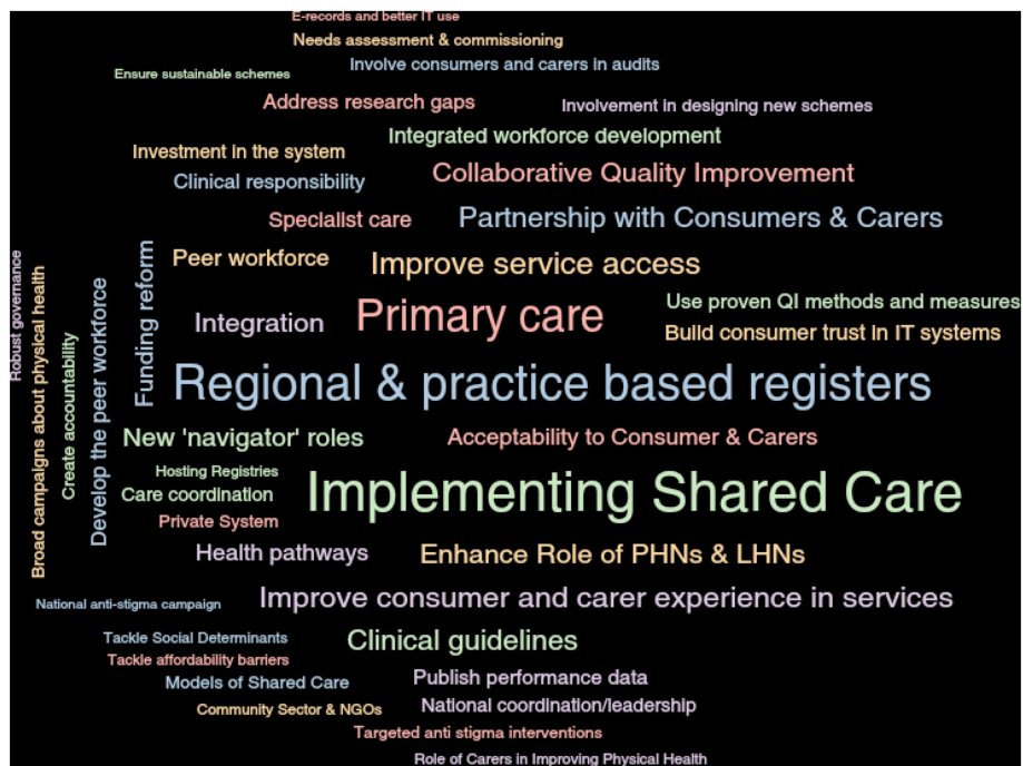
FIGURE 2 Word cloud of Roadmap priorities.