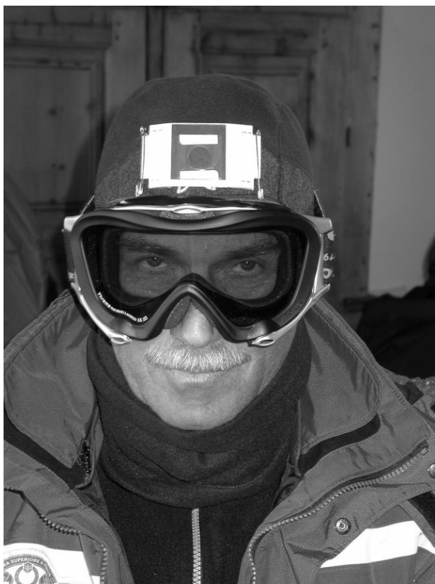
Fig. 1. Instructor, dosimeter attached to the cap.

curves: the lowest site of Saint Christophe, at Les Grange and at La Thuile-Les Suches ski field. At each site a series of dosimeters (from the same batch of those used during the field campaigns) were exposed on a horizontal plane to solar UV radiation from 10:00 to 16:00 LT in order to cover the entire range of solar zenith angles which can be viewed from the dosimeter worn by volunteers. Dosimeters were removed at specific time intervals and at the same time UV dose rates were measured by the nearby broad band radiometer. The absorbance changes versus the corresponding ambient UV doses provided the calibration curve at that site.