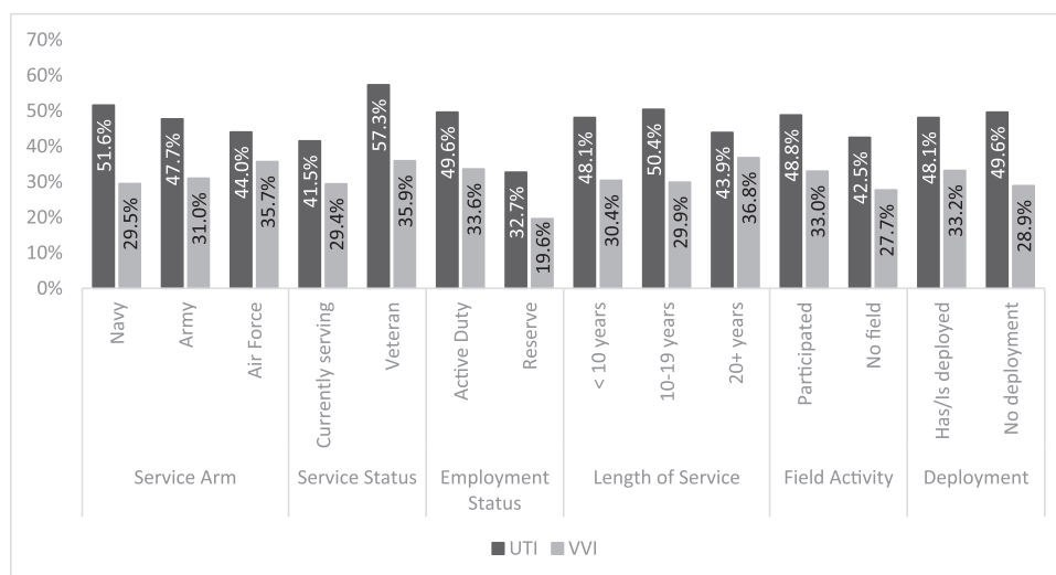
FIGURE 1 Period-prevalence of UTI and VVI during most recent period of active-duty service (various demographic features). UTI, urinary tract infection; VVI, vulvovaginal irritation.

The influence of the ADF work environment and occupational roles on the ability of servicewomen to manage UTI was explored within the cohort. Small numbers of servicewomen reported that their work in the ADF had no impact on their ability to manage UTI