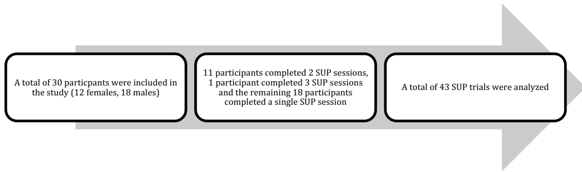
Figure 1. Description of participant breakdown and number of SUP trials that were included in the analysis.

On average, males were older (+ 13.9%), significantly taller ( p < 0.05 , +7.0%), and heavier (+ 18.5%) than female participants. Given the differences in height and mass, males also had a significantly ( p < 0.05 ) higher BMI (+ 5.8%) and Body Surface area (BSA) (+14.4%) than female SUP participants. Males rated themselves more competent than females (+ 12.0%), despite females being more experienced in SUP (+ 16.6%). Table 1 illustrates the participants physiological characteristics.