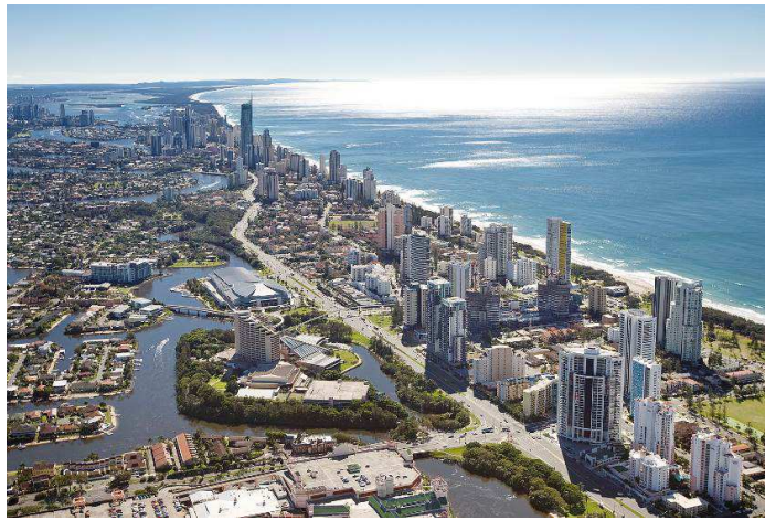
Fig. 2: Aerial view of Gold Coast

The paper now identifies key opportunities and challenges for developing Gold Coast into a smart city under the five identified themes of the smart city framework. The discussion below is based on critical understandings of the city's existing context as well as various policies of local and state governments.