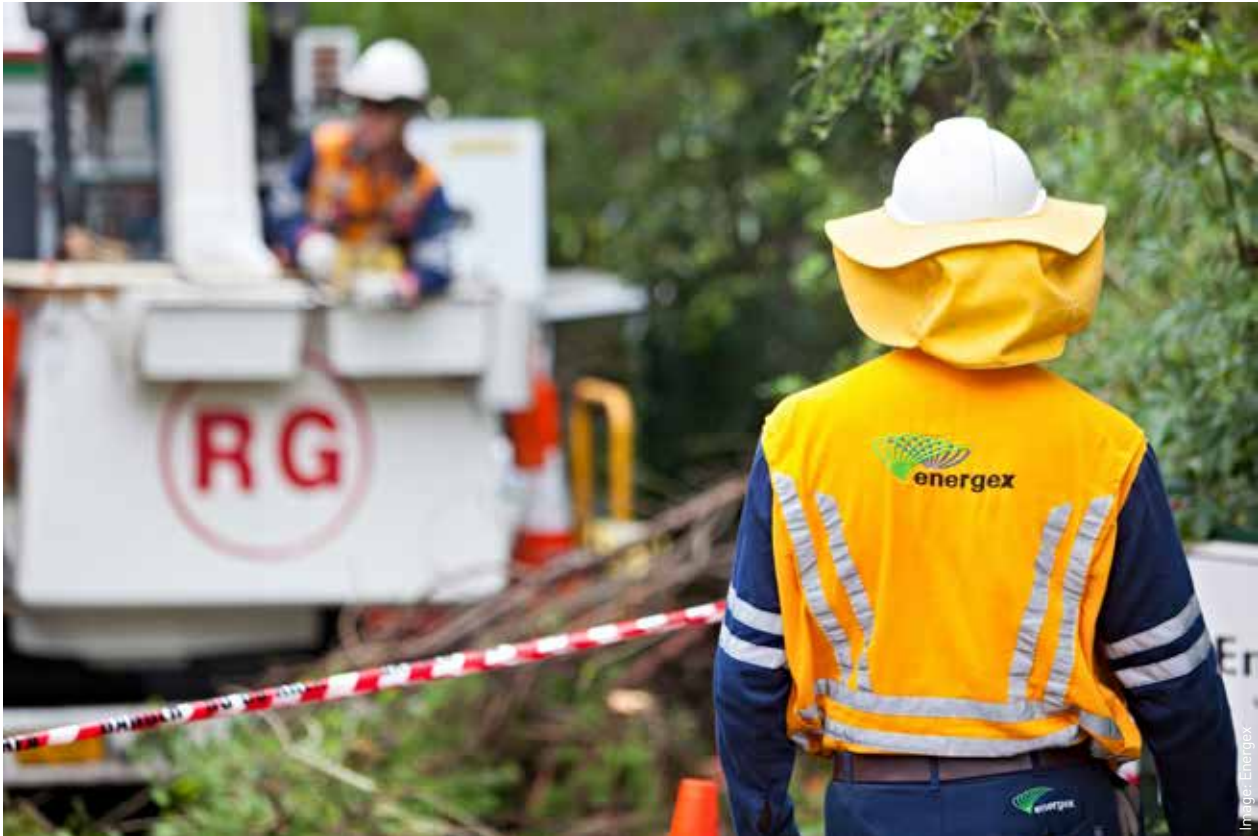
Energex representatives participate in local, district and state emergency management groups in Queensland.

on the development of strategic or responsive public-private partnerships involving small to medium private sector organisations, or even large, 'less-critical' private enterprises (e.g. the mining industry). The emphasis is on broad procurement protocols (e.g. for evacuation centre and emergency supplies), general community-building and individual business continuity.